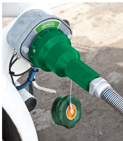
One Connection for Overfill Prevention and Grounding

Only Scully offers you a complete, integrated overfill prevention and vehicle grounding system for maximum safety in your loading operations.