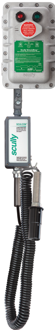
Scully Groundhog Control Monitor with Plug and Cable