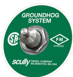
Scully Ground Bolt