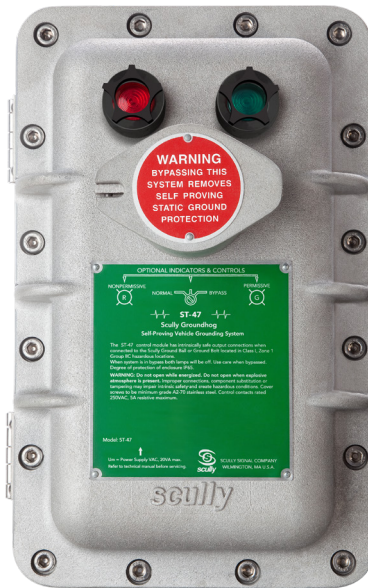
Groundhog Ground Verification System

Featuring Dynacheck® – Automatic and Continuous Self-Checking Circuitry